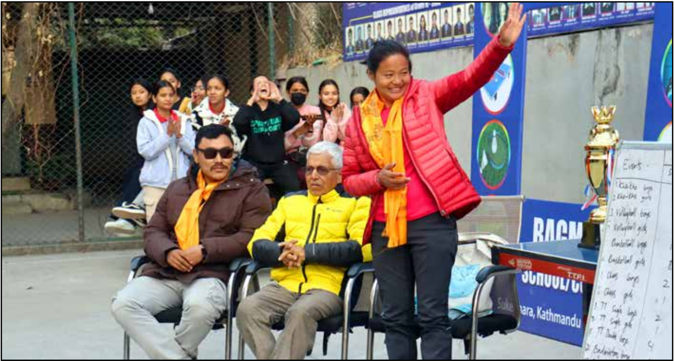
Welcoming Mira Rai (Record Holder Trail and Sky Runner) as Goodwill Ambassador of Bagmati School/College.